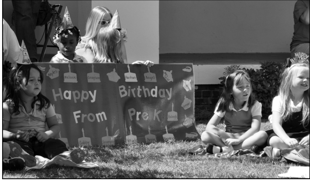
Students Celebrating 90th Anniversary of Pintlala School